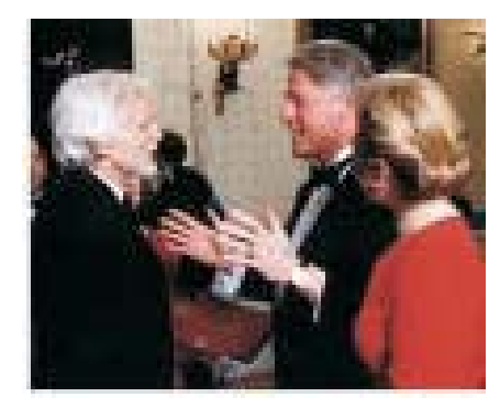
Page 2

I admire these women not only because of their success but also for their personalities. They have had a great affect on my life. Whatever trouble I meet, I always tell myself that I need a magnanimous heart and then I become calm and solve the problem. Also, I understand that even though I can't enter into a famous university, I still should get an education because wisdom is very important and my education will never end as long as I'm trying to become like my role models.