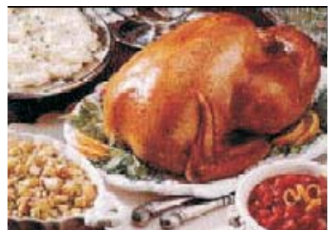
<u>Thanksgiving.drbrainzlab.com</u> days are different, the celebrations are similar.

Although Canadian and American Thanksgiving Days have a little are nce,